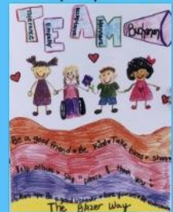
example of past cover

Questions? Email: buchananyearbook2020@gmail.com